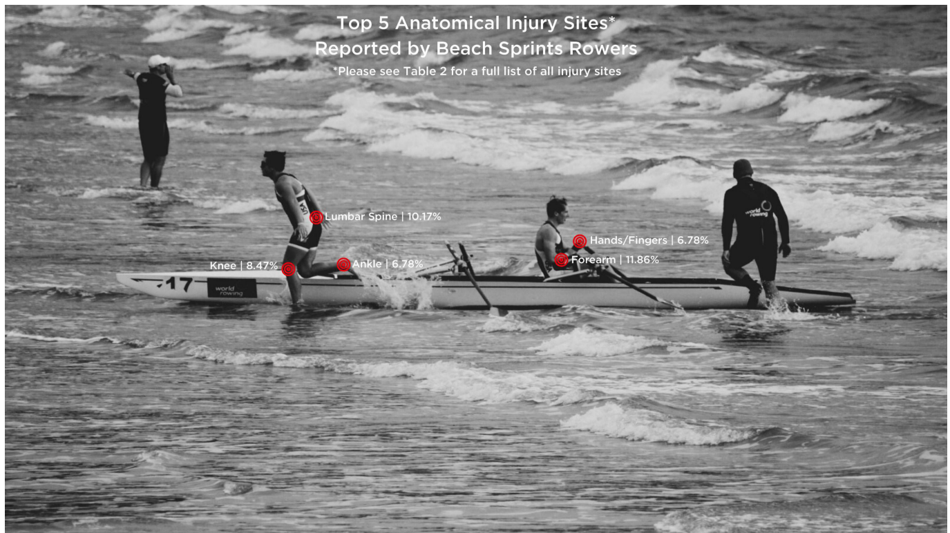
Figure 3 Top five anatomical injury sites of Beach Sprints rowers at 2022 World Championships.